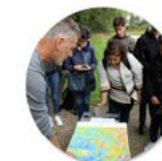
Tell the Stories

Maps, artifacts, images, mixed and augmented reality