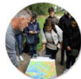
Tell the Stories

Maps, artifacts, images, mixed and augmented reality