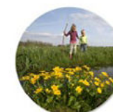
Engage with the Public

People and the relationship with nature, bring in societal value by raising awareness for protection of our present and future landscapes and its bio-cultural diversity