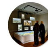
Visualize our History

Maps, artifacts, images, mixed and augmented reality